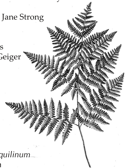
Pteridium aquilinum bracken fern