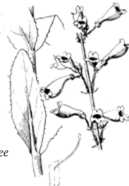
Penstemon floridus Brandegee Rose Penstemon